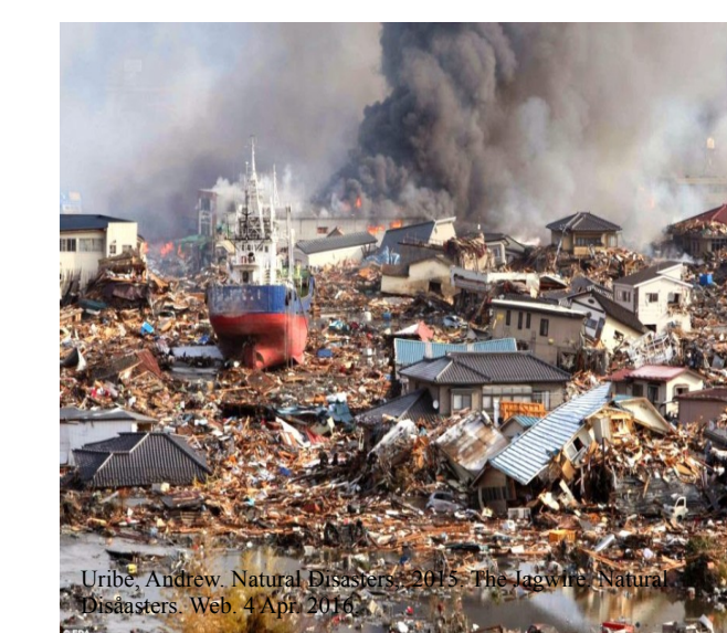
A Natural Disaster